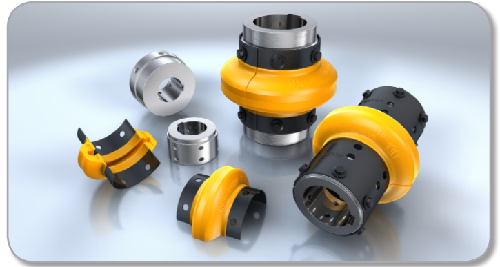
Taper Bush hub Finish bore hub