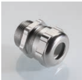
Abb. 1 Fig. 1