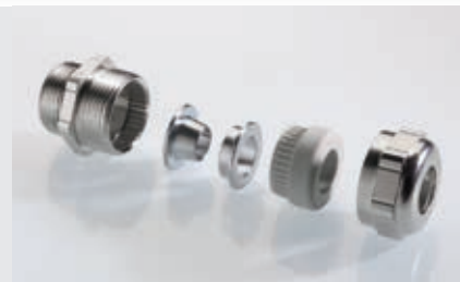
Abb. 2 Fig. 2

Messing vernickelt Metrisches Anschlussgewinde EN 60423 Schutzart IP 68 bis 10 bar Grundlage für technische Angaben: EN 62444