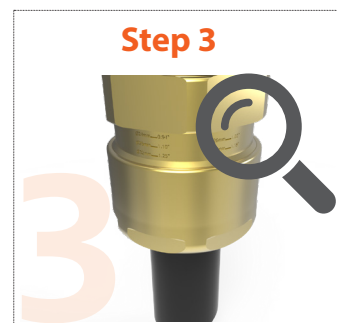
The backnut should be level with the marking guide corresponding to its diameter – this can be visually inspected and adjusted as necessary

Note: The cable gland installation instructions have a printed cable OD measure for if the cable OD is not known