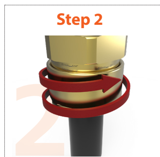
Tighten backnut until a seal is formed onto the cable, then tighten one further turn