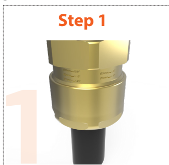
Follow cable gland installation instructions until final stage – tightening of rear seal

The gland is permanently marked with various lines/numbers indicating the correct tightening level related to the cable diameter. Following the relevant cable gland Installation Instructions, the back seal should be tightened until a seal is formed on the cable outer sheath and then tightened one further turn.