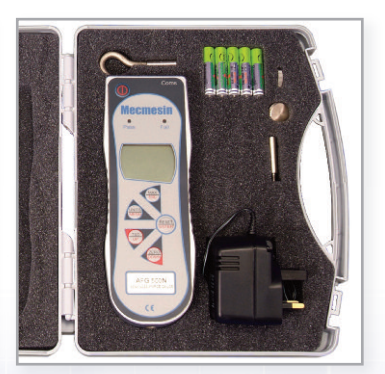
AFG and accessories