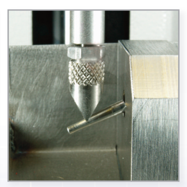
Compression test on medical device