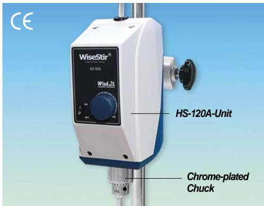
High-Speed Analog Overhead Stirrer “HS-120A -unit”