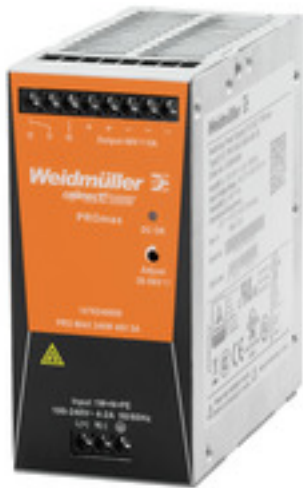
Similar to illustration